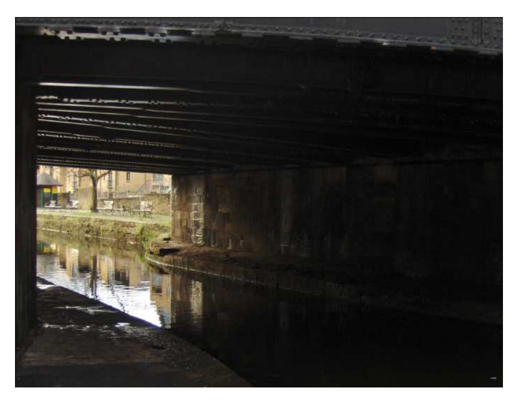
Photograph showing the darkness under the Penny Street Bridge

British Waterways have stated that it would be possible to install lighting under the Penny Street Bridge or in any similar area but that they would be reluctant to pay for this or cover any maintenance costs. If the Council was to approach British Waterways regarding this idea then they would consider the case on its merits.