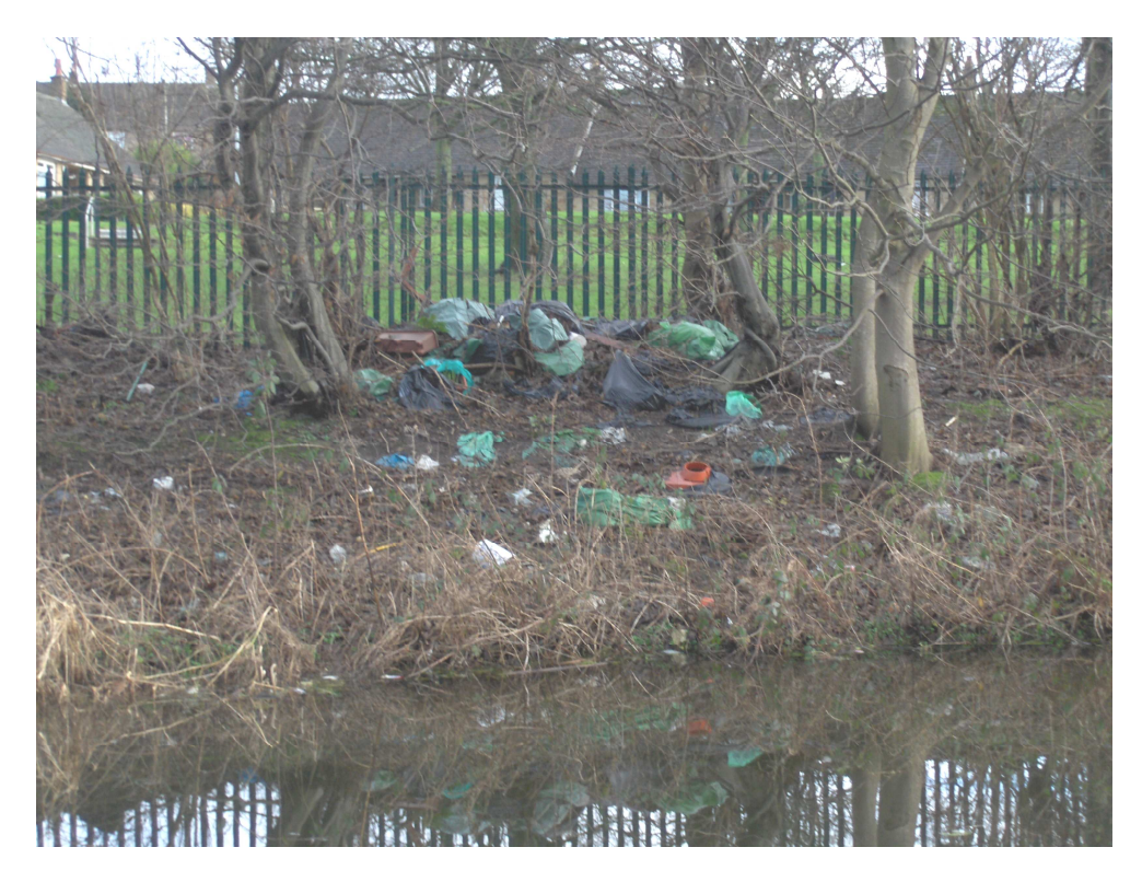
Photograph showing 'hot spot' of fly tipping next to the Ridge Estate

Lancaster City Council's responsibility with regard to litter, fly tipping, dog fouling and pollution is minimal along the canal as the land is predominantly owned by British Waterways and it is therefore their legal responsibility to deal with these problems on the land they own.